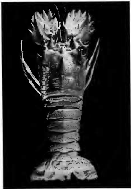
FIG. 1. — Scyllarus rapanus sp. nov., male holotype (MNHN-Pa 1394).